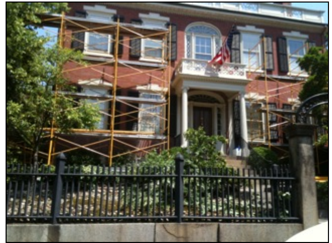
The scaffolding goes up again!