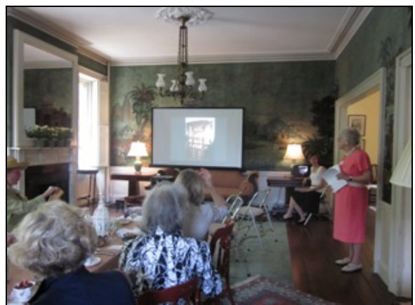
Po's porcelain presentation.